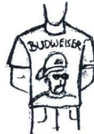
No profane/vulgar, discriminatory words/pictures or references to drugs/alcohol